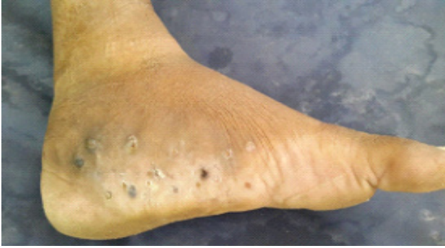
Fig.1: Picture shows multiple nodules with sinuses draining seropurulent discharge over medial aspect of left foot

On local examination, pus discharge showed pale coloured grains. Grams stain-smear showed many pus cells and gram positive bacilli with branching filaments. Culture of bacteria and fungus showed no growth after 15 days of incubation. Histopathology showed aggregates of granules which were admixed with hyalinised amorphous material with peripheral radiating club like projections (Splendore-Hoeppli material). These granules were surrounded by inflammatory infiltrate composed predominantly of neutrophils and also eosinophils, lymphocytes, plasma cells and epithelioid macrophages (Fig 2). X-ray showed soft tissue swelling on medial aspect of left foot and evidence of lucencies in shaft of 1 st & 2 nd metatarsals with mild expansion of shaft of 2 nd metatarsal (actinomycetoma).