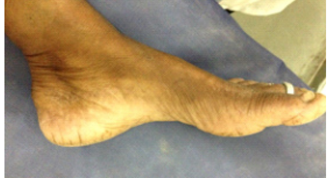
Fig 3: Treatment response after two cycles of Welsh regimen

Based on history, cutaneous examination, histopathology and immunofluorescence study, diagnosis of actinomycetoma was confirmed. Patient was started on Welsh regimen: Injection Amikacin 375 mg (15 mg/kg) twice daily and Tablet Cotrimoxazole DS (160/800 mg) twice daily for 21 days followed by Tab. Cotrimoxazole DS twice daily for 15 days. Two such cycles were instituted. Patient responded very well to the medication and was on regular follow up (Fig. 3).